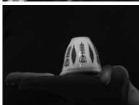
Renata Poljak La Crise , 2009 Video loop 12 min. Sound by Annika Grill

happened, whose still active remnants haunt the hidden spaces of the convent; like chance, which Davide Balula's vortex machine tries to do away with by a complete dilution of the dots on dice ( La Dilution des coïncidences , 2007); it is also like the crisis against which Renata Poljak opposes the outmoded strength of popular superstitions ( The Crisis , 2009); ultimately, it is to be found in the catastrophe that Dafna Maimon's film Disaster (2007) stretches into unbounded duration as if it never allowed renewal. These ruptures in the continuum of existence stand as the fascinating and vertiginous evidence of the possibility of the impossible, both because they bear in themselves the promise of more invention, of more creation and of the emergence of something unprecedented, as well as because of the well-known idea that the worst is inconceivable and yet to be feared.