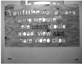
Denicolai & Provoost Youtube Was a Video , 2008 Milled wood panel, glued and lacquered letters 98,4 x 175 cm Courtesy aliceday, Brussels

In the 1950s, the anthropology of the future emerged together with prospective, born out of the disaster of the war and the need not to be taken by surprise anymore. An attitude and ability—rather than a science—enabling one to foresee what would happen if men didn't change the way things go. Rather than predicting the techniques of the future in the wake of those of the present time, as futurologists do now without distancing themselves from their meaning, prospective—as it was thought out by Gaston Berger, its main founder—concentrates on what human needs should be satisfied in the present without lapsing into easy futurism.