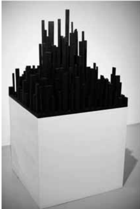
Reynald Drouhin Cité , 2008 Burnt wood sculpture 79 x 79 x 79 cm

so doing, to unfold its different forms: “what comes to us,” “what becomes/ what comes again ,” “what comes up,” “what comes from us.” These different forms—tackled successively in the four opuscles of this edition—are not so much the expression of themes as interconnected sentences expressing the same experience of time to come, which binds together anticipation and action as well as event and flux.